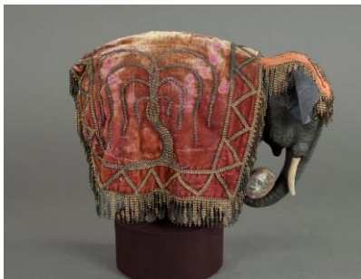
Beech-Nut Circus Elephant, c. 1936 Rubber, wood composite, copper-alloy, silk, and fabric