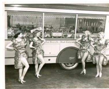
Beech-Nut Circus Car with costumed people, c. 1936 Photograph, Arkell Museum, Gift of Beech-Nut Nutrition Corp., 1996