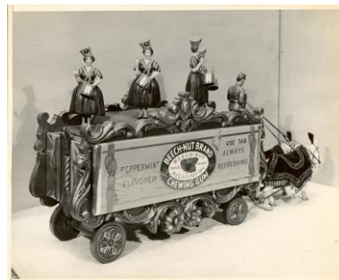
Miniature Sample Girls on Peppermint Gum Float, c. 1936 Photograph, Gift of Beech-Nut Nutrition Corp., 1996